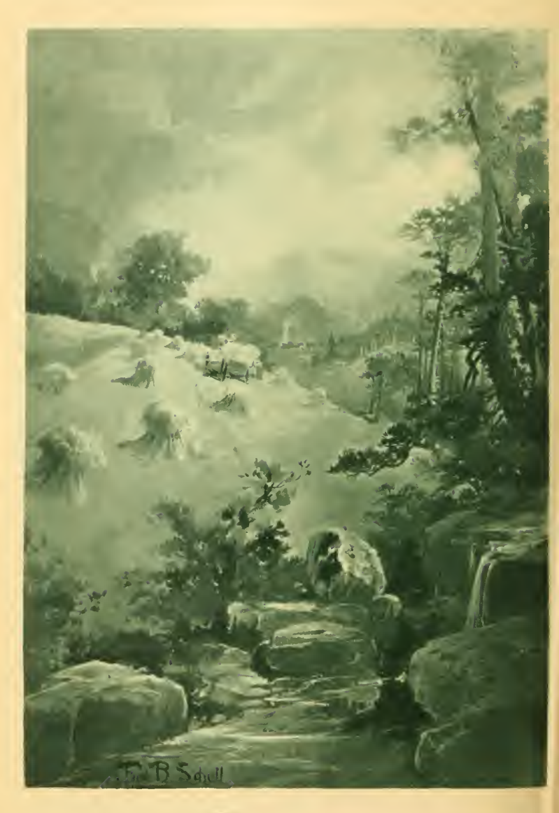
To the mountain